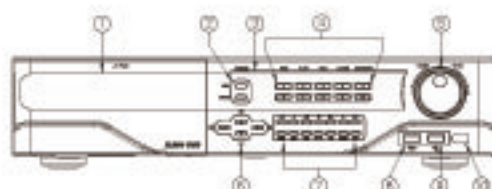
Front Panel Layout